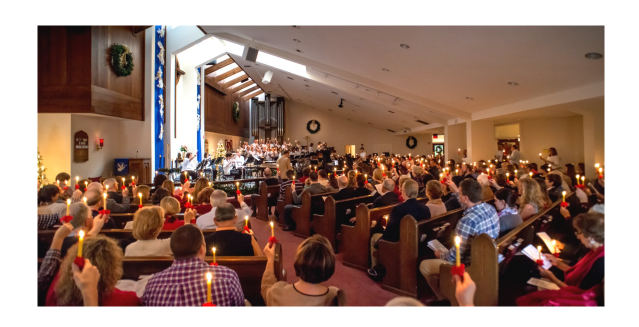
Love Feast in Moravian Tradition December 9 and 10, 2023 Christ Our Shepherd Lutheran Church Peachtree City, Georgia